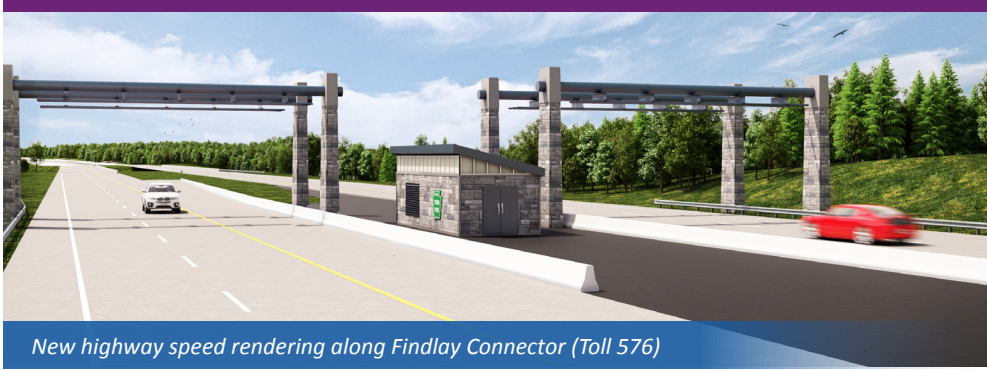
New highway speed rendering along Findlay Connector (Toll 576)