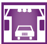
AET In Place

With cashless tolling, all motorists benefit from the convenience of nonstop travel. Tolls are assessed electronically as motorists keep moving at the posted speed. Customers pay using E-ZPass or the PA Turnpike TOLL BY PLATE program. E-ZPass customers will have their toll